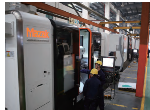
Multi-tasking CNC from Mazak

The latest computer technology has been extensively applied in NEWAY manufacturing, which includes a large number of numeric control machines (machining center, CNC horizontal and vertical lathe and CNC drilling machine) and ERP management system. Additionally, the data through all factories has been connected and shared. These facilitate resource integration, boost productivity, evidently enhancing machining quality and tightening process control. Neway has established hyperbaric chamber test equipment with 3000m water depth capability to satisfy the testing requirements of subsea valve.