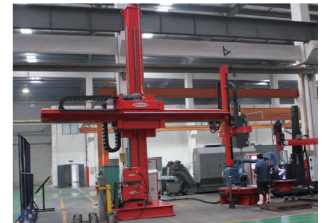
Hot-wire TIG Automatic Cladding System